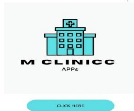
Figure 2: Front Cover View