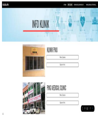
Figure 3: Inside the Apps View