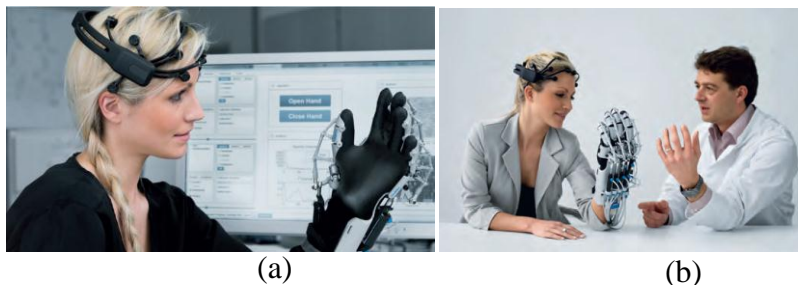
Figure 3. (a) The ExoHand in combination with a brain-computer interface (b) The ExoHand in the rehabilitation of stroke patients

In medical rehabilitation, the ExoHand can be used as an active manual orthosis. It is combined with a brain-computer interface (BCI), the ExoHand from Festo allows a closed feedback loop to be established. The active manual orthosis can help stroke patients suffering from paralysis to regenerate the damaged connection from the brain to the hand.